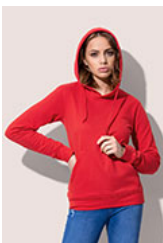
ST4110 Hooded Sweatshirt